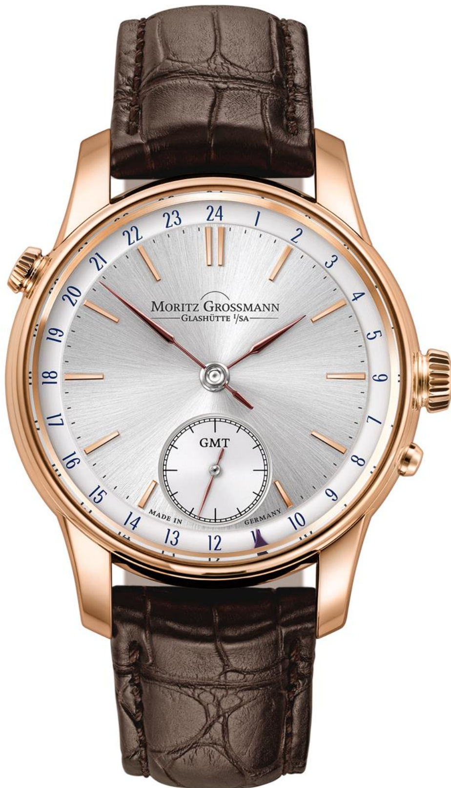
GMT rose gold, argenté opaline