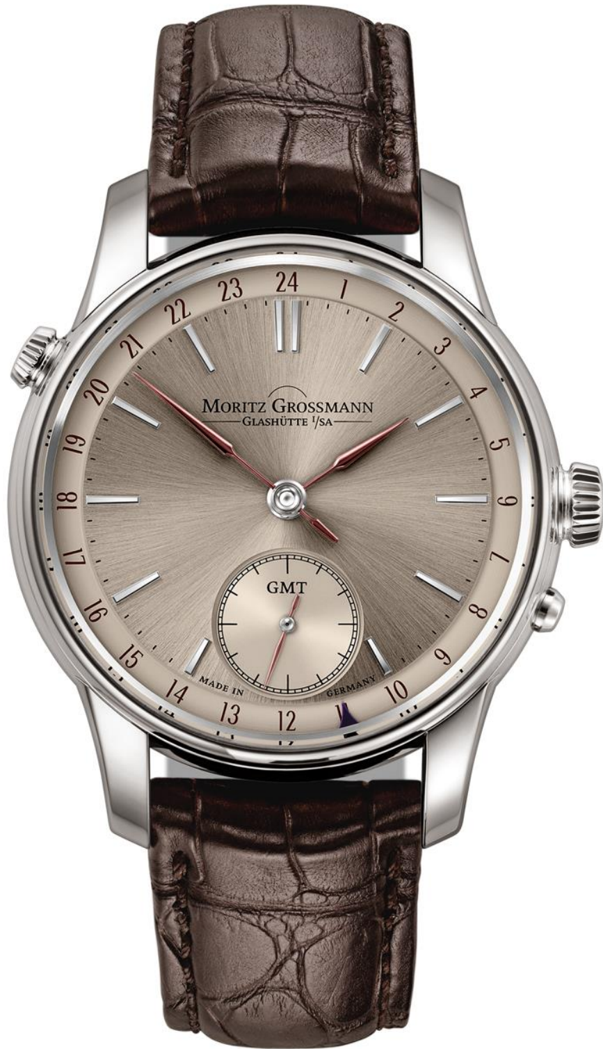
GMT white gold, champagne-tone