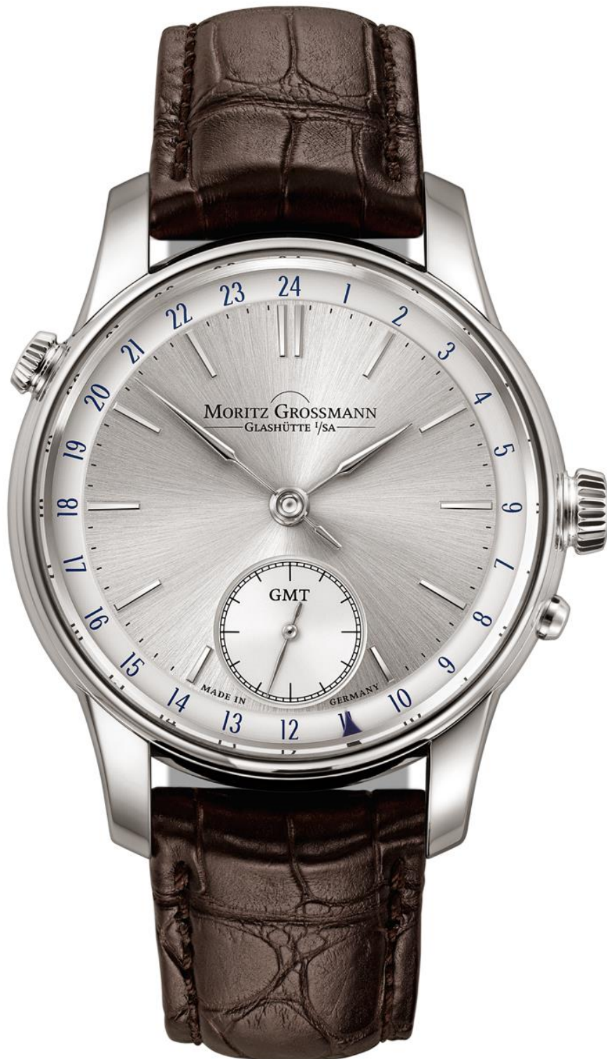
GMT white gold, argenté opaline